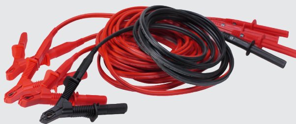
Detachable IEC61010-compliant combined HV / LV Kelvin test leads