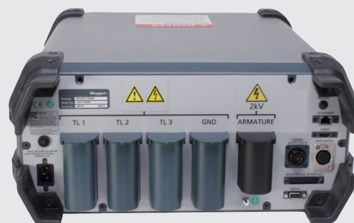
Back Panel connections for Ethernet, Power Pack Interface, HDMI, Serial port, Remote warning lights, E-Stop, and Footswitch